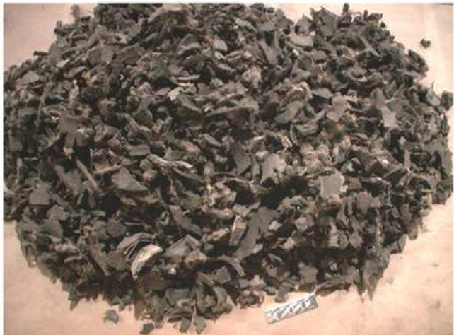
- Sample #2 - 1" Chip 90% metal free through 1 1/4" Screens (Stick of chewing gum in photo to compare size)