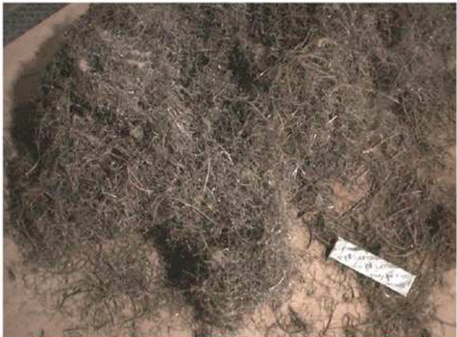
- Sample #4 - Clean wire through 1 1/4" screen (Stick of chewing gum in photo to compare size)

Sample #1 is a primary grind from a Shredder. Sample's #2, 3 & 4 are from a secondary grind with a HogZilla Grinder through 1 1/4" Screens. Samples 2-4 were easily separated because of the weight of the material coming off of the elevator as sample #1 was reground. The sketch below may help to explain. As material traveled off the elevator, the 1" rubber chips (sample #2) landed in one pile. It was thrown off the elevator further because of the heavier weight. Sample #3, a mix of metal, nylon and rubber was not as heavy so did not travel as far off the elevator. Sample #4, clean wire, was pulled below the elevator after being collected by the magnetic head pulley.