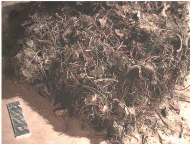
- Sample #3 - Fluff (mix of metal, nylon & rubber) Through 1 1/4" screen, can be reground to remove more metal. (Stick of chewing gum in photo to compare size)