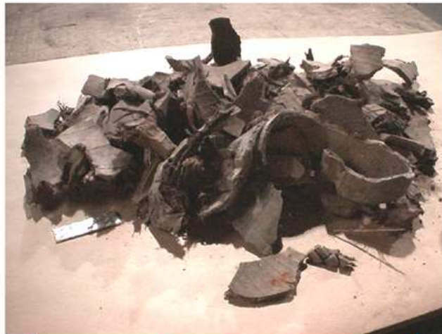
- Sample #1 - Starting product. Approx. 4" chips from Slow Speed Primary Shredder (Stick of chewing gum in photo to compare size)